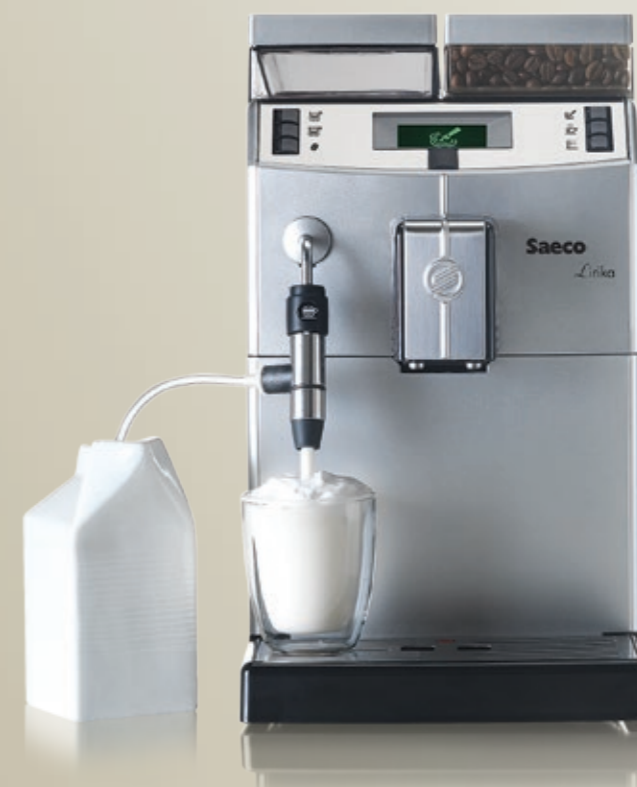
Lirika Siluro Cappuccinatore

Stainless steel Siluro cappuccinatore, to be mounted on the steam wand for the frothing of creamy cappuccinos and milk drinks. It can be used also in combination with the Milk Cooler.