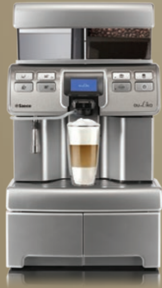
Aulika Top RI