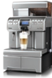
Aulika Top RI