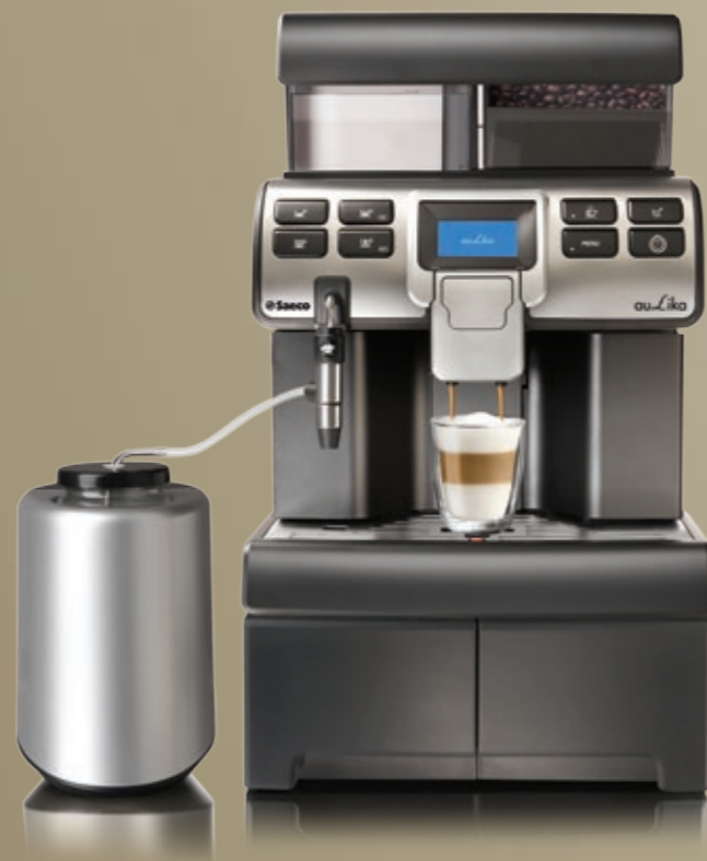
Aulika Mid Base

Painted metal and ABS matt black base, in family feeling with Aulika Mid, with 2 drawers for sugar bags, stirrers etc. Its use with the machine is suggested if the Astra refrigerator or Milk Cooler are present.